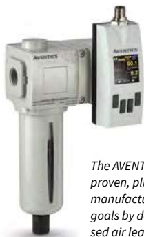
The AVENTICS Series AF2 Flow Sensor is a proven, plug-and-play solution that helps manufacturers meet their sustainability goals by detecting early-stage compressed air leaks.

Many manufacturers are using the AF2 to meet their sustainability goals through energy consumption monitoring. The AF2 is a plug-and-play solution that easily retrofits on existing equipment and continually measures eight parameters in real time. When it detects a leak, it sends an alert to appropriate personnel. By using the AF2, operators can quickly diagnose and address issues, significantly reducing energy use and improving OEE.