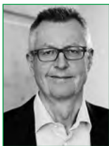
Robert Schullan CEO, HAWE Hydraulik Germany

“HAWE Hydraulik considers not only the manufacturing process, but the entire life cycle of its products and solutions in order to continuously reduce the ecological footprint. This can only be achieved in close cooperation with our customers and our internal and external supply chain. Concrete examples of this can also be found in the HAWE range of products of CETOP valves.”